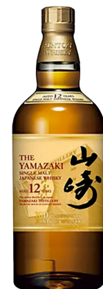
YAMAZAKI [12YR] PER GLASS NEAT / ON THE ROCKS: $40.0 WITH COKE OR SPARKING: $42.0