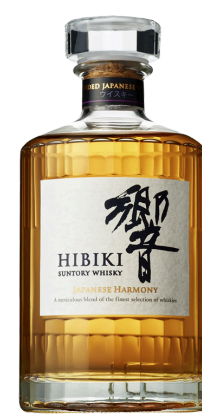
HIBIKI HARMONY PER GLASS NEAT / ON THE ROCKS: $25.0 WITH COKE OR SPARKING: $27.0