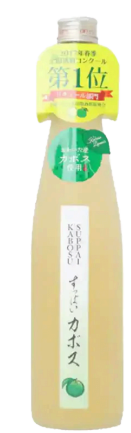
KABOSU [JP CITRUS] COCKTAIL