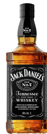
JACK DANIEL'S OLD NO.7 PER GLASS NEAT / ON THE ROCKS: $10.0 WITH COKE OR SPARKING: $12.0