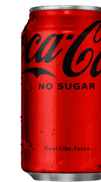
COKE NO SUGAR