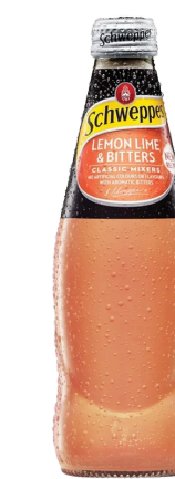
LEMON LIME BITTER