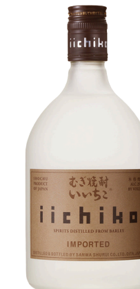
IICHIKO $16.0 / GLASS $105.0 / BOTTLE