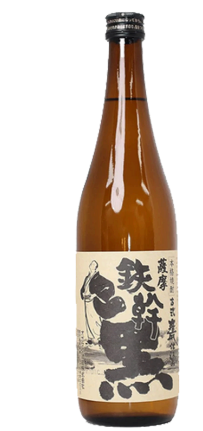
KURO TEKKAN $15.0 / GLASS $95.0 / BOTTLE