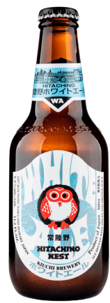
HITACHINO WHITE ALE