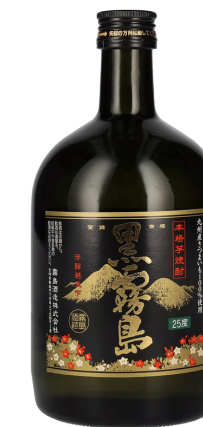
KURO TEKKAN $14.0 / GLASS $90.0 / BOTTLE