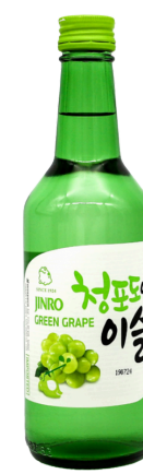
KOREAN SOJU GRAPE