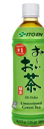
COLD GREEN TEA