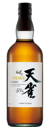
TENJAKU [HIGHBALL] PER GLASS NEAT / ON THE ROCKS: $14.0 WITH COKE OR SPARKING: $16.0