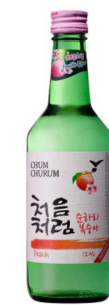
KOREAN SOJU PEACH