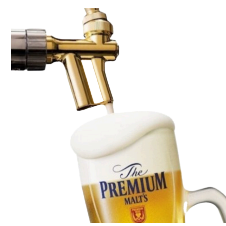
GLASS OF CRAFT BEER