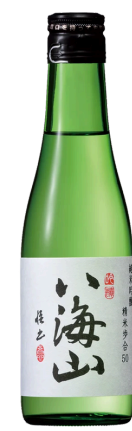
HAKKAISAN [300ML] $75.0 HOT/COLD/WARM