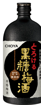
CHOYA KOKUTO UMESHU