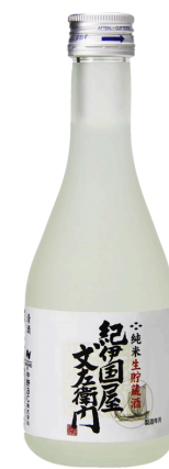
NAMACHO [180ML] $18.0 HOT/COLD/WARM