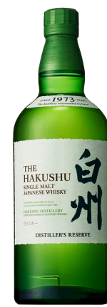
HAKUSHU RESERVE PER GLASS NEAT / ON THE ROCKS: $25.0 WITH COKE OR SPARKING: $27.0