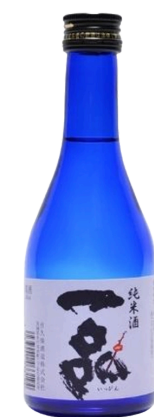
IPPIN [300ML] $29.0 HOT/COLD/WARM