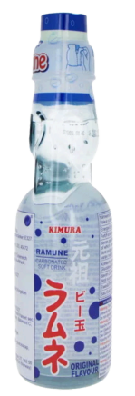
RAMUNE [JP LEMONADE]