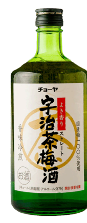
UJI MACCHA UMESHU [GREEN TEA]