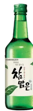
KOREAN SOJU ORIGINAL