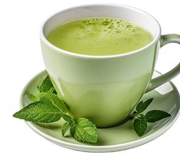
HOT GREEN TEA